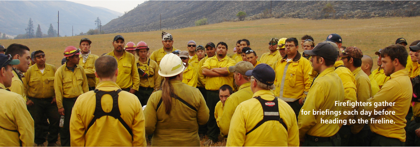
Firefighters gather for briefings each day before heading to the fireline.

Learn more online about DNR Wildfire Assessments