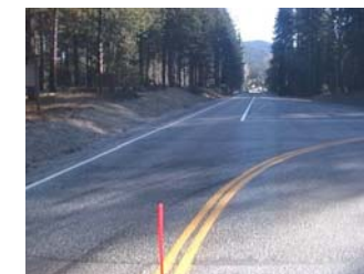
(Left) Chiwawa Loop Road