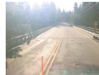
(Left) Chiwawa Loop Road