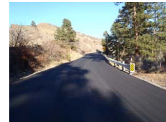
(Left) New surface and guardrail on Stemilt Loop Road