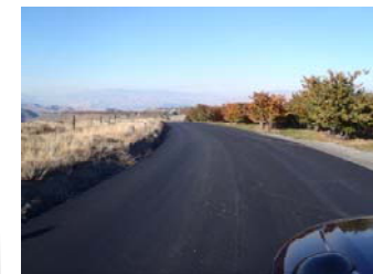
(Left) Project completes road repair for Stemilt Loop Road.