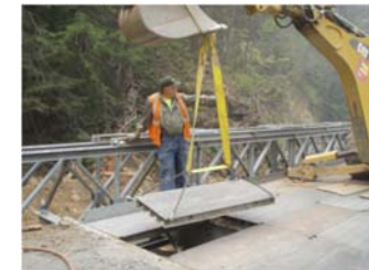
(Left) Deck work on the new Blewett Bridge.