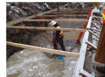
(Left) Pouring concrete for new abutments.