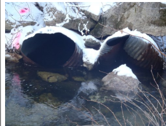
(Left) Culverts destroyed by debris flow.