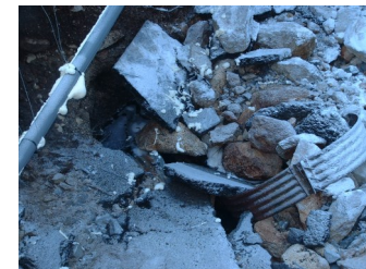
(Left) Culverts destroyed by debris flow.