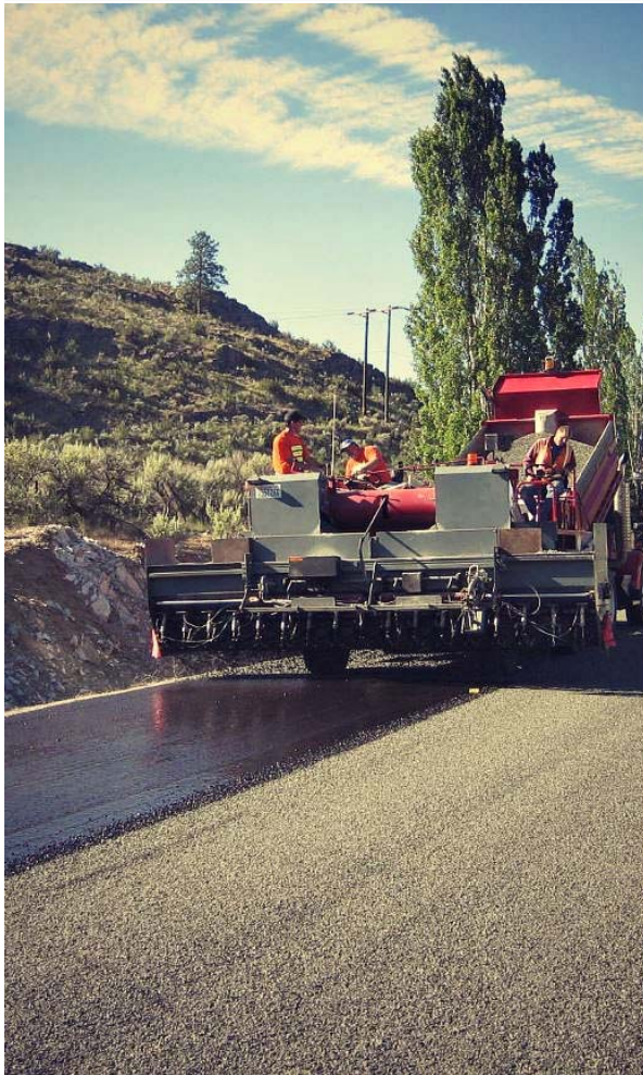
County Crew Chipsealing