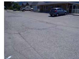
(Left) Pavement deterioration on Pedoi Street to be repaired.