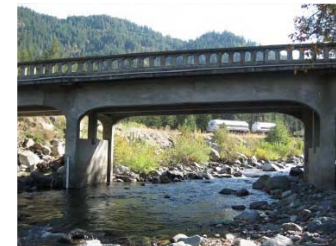
(Left) Peshastin Creek- Ingalls Bridge #321 Span