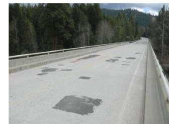
(Left) Wenatchee River Bridge #20912 Deck