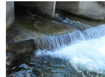
(Left) 25 Mile Creek Culvert