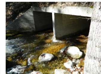
(Left) 25 Mile Creek Culvert