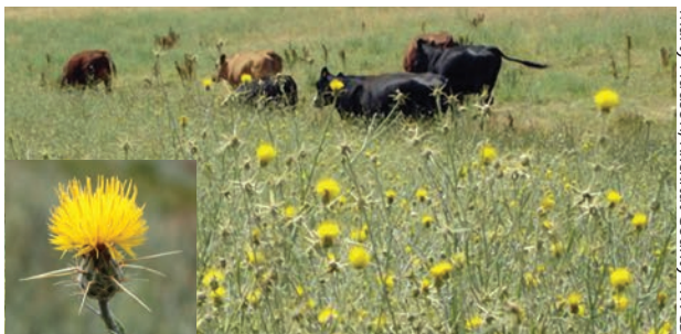
Marty Hudson, Klickitat County NWCB

It is important to control noxious weeds to help protect our diverse native plants, natural resources, and agriculture. Although some noxious weeds may serve as forage for bees and other pollinators, the detrimental impacts of these invasive plants significantly outweigh their value as a pollen and nectar source.