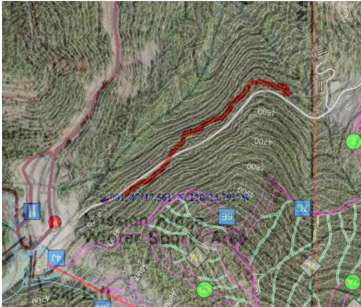
Photo - road overlay