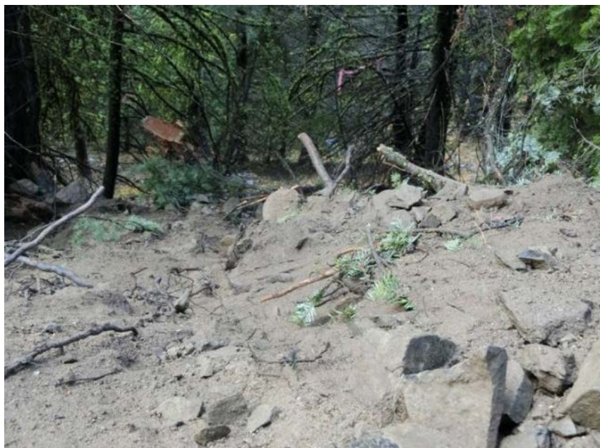
Photo - sidecast below road