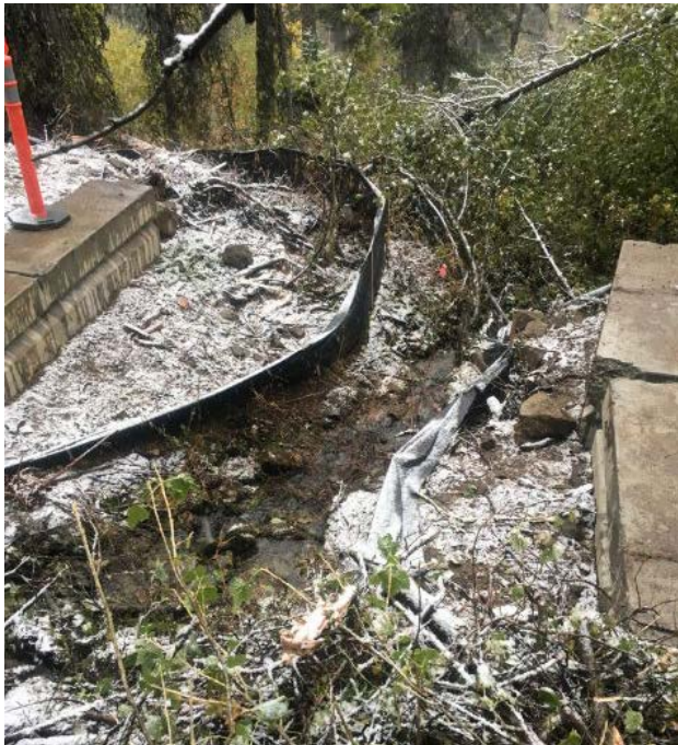
Photo - Seasonal Stream where bridge was required but not built