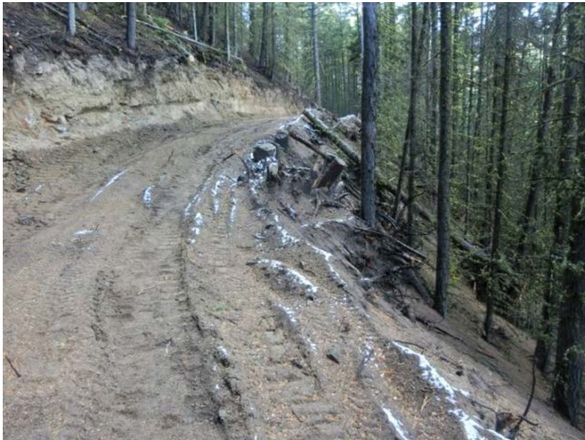
Photo - sidecast below road