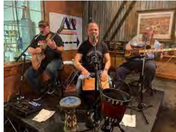
Older & Wiser Band