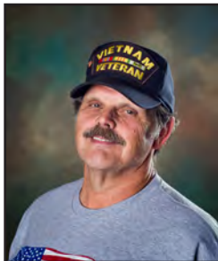
Thomas Gray Cashmere