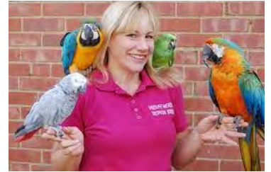
Wendy's Tropical Birds