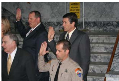
Swearing In of Elected Officials

For those of you who haven't kept track, we already passed the six month mark since my post-election swearing in. One thing that I've discovered over these months is, no matter how effectively I think we're communicating, there is usually somebody who feels "left out of the loop." Anthony Robbins, an internationally recognized leadership consultant tells us, "To effectively communicate, we must realize that we are all different in the way we perceive the world and use this understanding as a guide to our communication with others." To follow this advice, I'm giving written communications a go— Introducing: Volume 1, Issue 1 of CCSO News Bytes. I hope, through this venue, to encourage more consistent communication, and broader knowledge of what is happening around the office. In addition, to provide