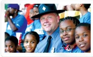
A Virginia State Trooper catches a game with kids from his local "Badges for Baseball" program

The Badges for Baseball program was created in collaboration with the U.S. Department of Justice as a juvenile crime prevention initiative. While beneficial for youth from a