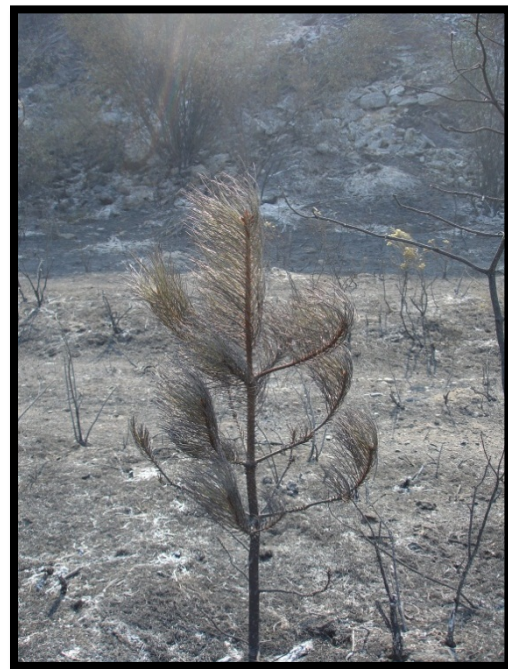
Ponderosa pine sapling with needles "set" in the direction the heat and fire moved past it. This tree is unlikely to survive its injuries.