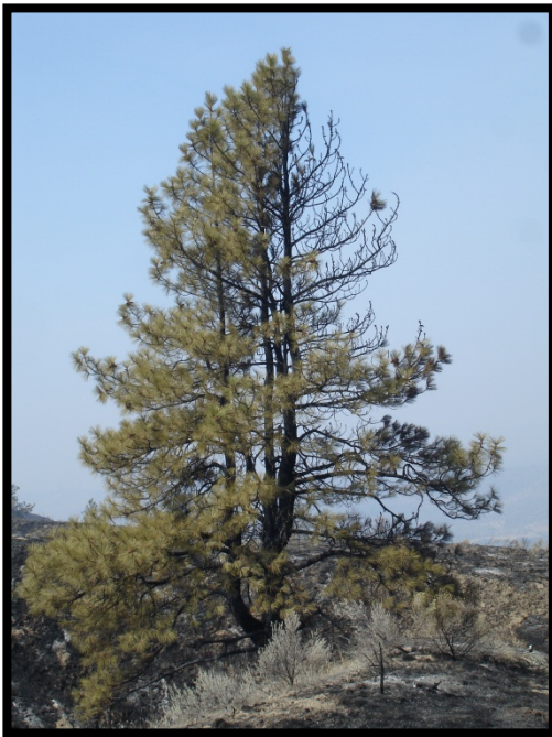
Ponderosa pine with 100% of its live crown scorched and some of the needles consumed. This tree is unlikely to survive its injuries.

If so, the tree likely received a lethal injury and is dead or will die.