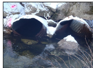
(Left) Culverts destroyed by debris flow from flood event.