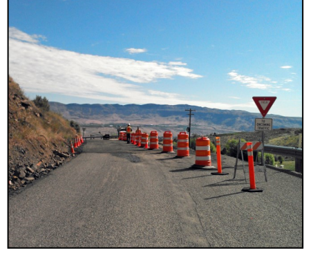
Joe Miller Road, at milepost 2.20, will be restored to a two-lane road.