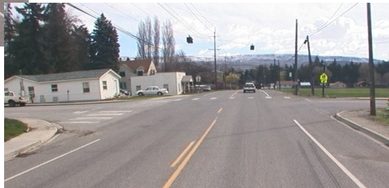
Easy Street and School Street