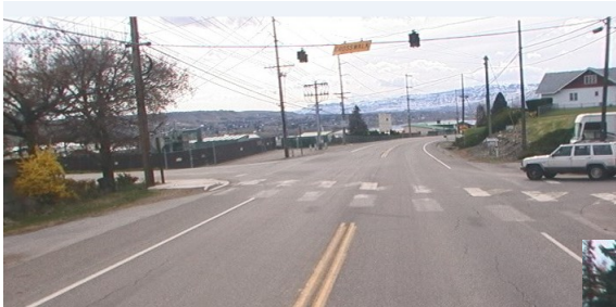
Easy Street and Peters Street

Traffic Impacts: During construction travelers should expect flagger-controlled traffic with delays up to 10 minutes.