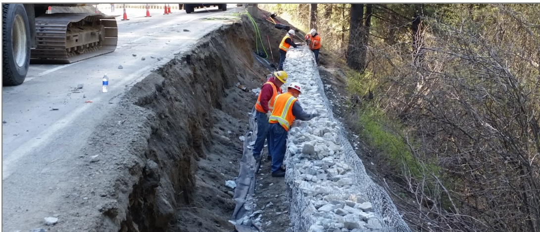
Crews building gabion wall

Travel Impact: Speed limit was decreased from 50 MPH to 35 MPH through the work zone with flagger-controlled traffic with delays up to 15 minutes during work hours. At night there was a marked lane shift to accommodate two-way traffic.