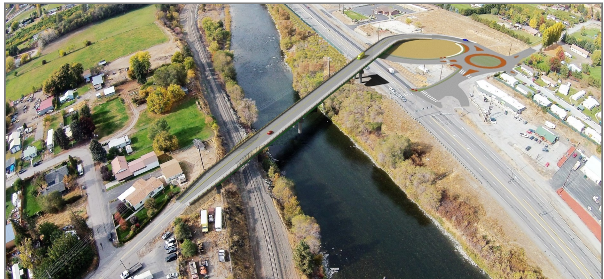
Rendering of Proposed Replacement Bridge