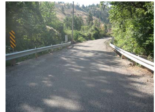
(Above) Stemilt Creek Bridge #102 Deck