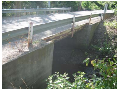
(Above) Stemilt Creek Bridge #102