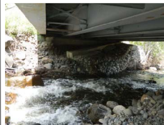
(Left) Failing Abutment on Kingsbury Bridge #804A