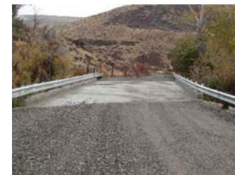
(Left) Kingsbury Bridge #804A Deck