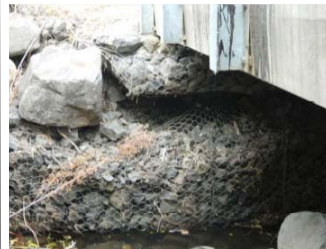
(Left) Failing Gabion on Stone Hill Bridge #915