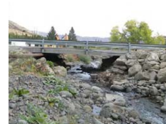
(Left) Colockum-Dillville Road Bridge #910 Elevation