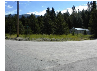
(Left) Condition of Chiwawa Loop Road.