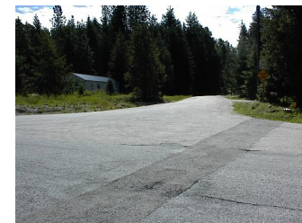
(Left) Condition of Chiwawa Loop Road.