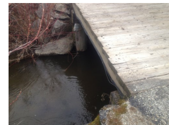
(Left) Motteler Bridge (FFC09)