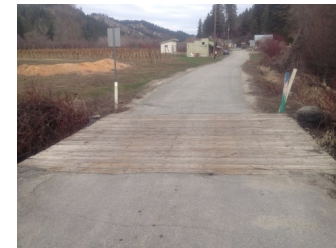
(Left) Motteler Bridge (FFC09)