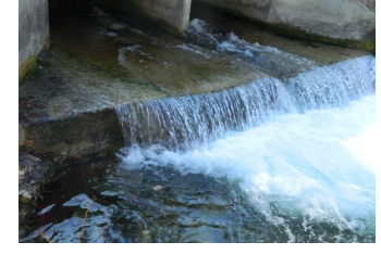
(Left) 25 Mile Creek Culvert