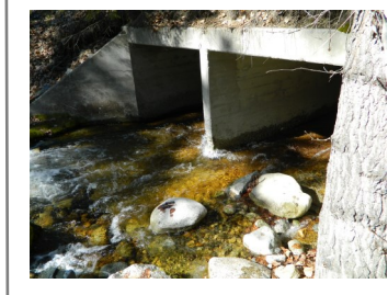
(Left) 25 Mile Creek Culvert