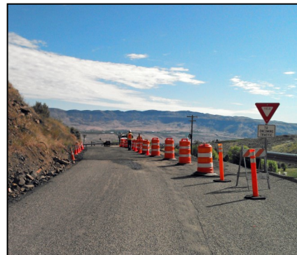
Joe Miller Road, at milepost 2.20, will be restored to a two-lane road.