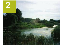
Wetlands, Confluence State Park, Historylink.org