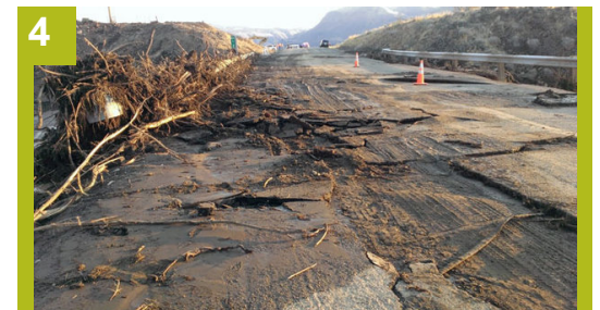
Malaga Mudslide