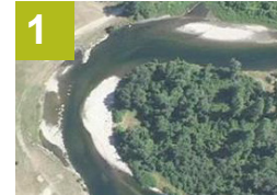
Icicle Creek Restoration Site, Chelan County Dept. of Natural Resources