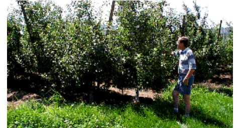
Apple orchard in Chelan County, WSU Extension