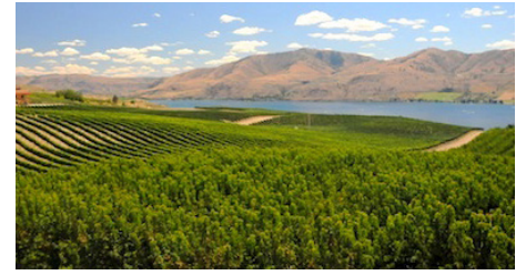
Lake Chelan vineyard

Chelan County, the Cascadia Conservation District (CCD), Chelan-Douglas Farm Bureau, and local producers and technical experts have formed a VSP Work Group. Their Work Plan was approved by the State Conservation Commission in April 2017. The Work Group can provide technical assistance such as our Stewardship Checklist to identify conservation practices you already have in place and others you might want to try to benefit your agricultural operation and protect critical areas.