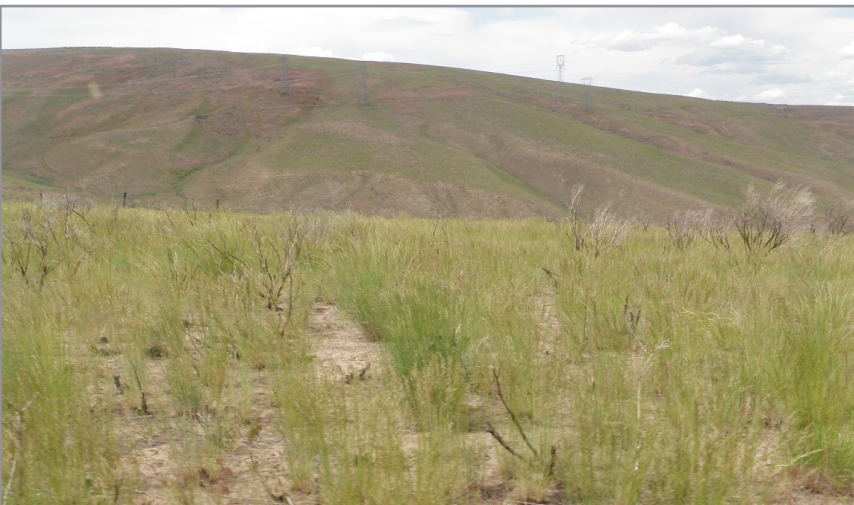
Rangeland Habitat Replanting, NRCS