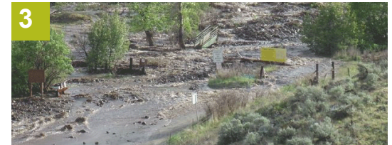
Colockum Creek Road Washout, WSU Chelan-Douglas Extension