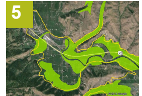
Potential Aquifer and Alluvial Soils, Wenatchee Basin Area, BERK 2014