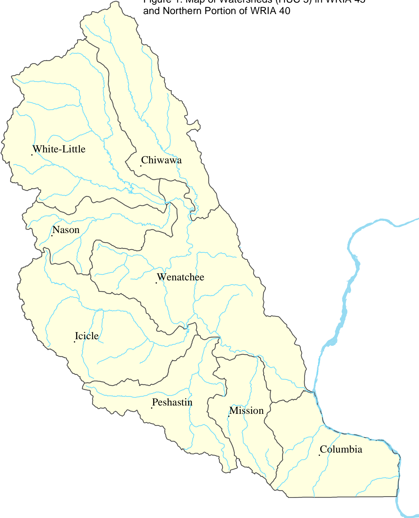
Figure 1: Map of Watersheds (HUC 5) in WRIA 45 and Northern Portion of WRIA 40