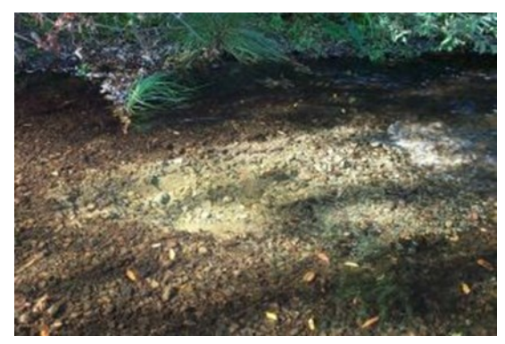
A Chinook nest or redd looks like a bright and clean spot in the river bed.