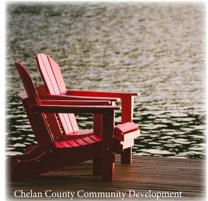
Chelan County Community Development