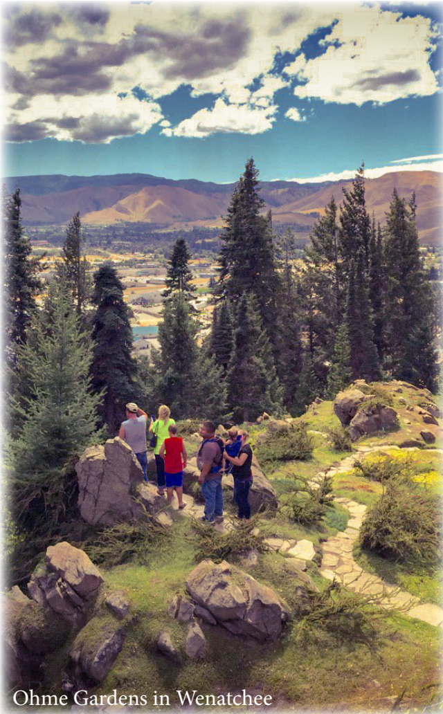
Ohme Gardens in Wenatchee

www.VisitChelanCounty.com or @WashingtonsPlayground on Facebook